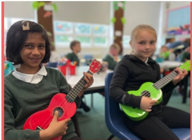
P4 pupils enjoying their ukulele lesson with a YMI tutor.

The children loved learning new songs and being able to develop their confidence each week by revising the songs. Learning about pitch, tempo and the Scots element was fantastic!