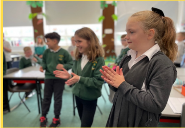
Pupils at Murrayburn PS taking part in a rhythm-based warm up game.

Our YMI sessions, delivered by our fantastic tutors, impact positively on pupils' learning experiences not only in music, but also in other areas of the curriculum, including numeracy, literacy and health and wellbeing. Here are some comments from class teachers about their experiences of YMI this summer: